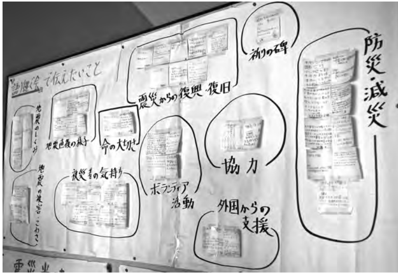
Figure 1 What the “Telling earthquake stories” wants to tell

“Telling earthquake stories” creates a horizontal group learning across the class based on interest themes, as well as a vertical mixed grade learning pairing off sixth-graders with fifth-graders. However, all are children born after the earthquake, with no direct experience of it. How is it possible, then, for these children who don’t know the earthquake to “tell its stories”? I discuss this point in detail below.